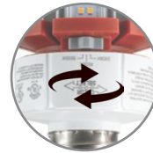
Color Select Switch