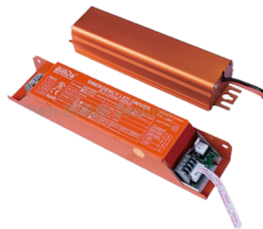
Traditional Wall Pack Backup Driver Order Code: 11468

Easily access our DLC qualified products with rebates in your area.