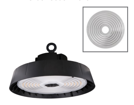
Frosted Lens Order Code: 11615

Easily access our DLC qualified products with rebates in your area.