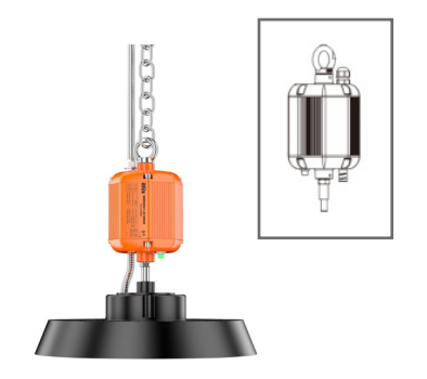
Emergency Backup Driver Order Code: 11499

Average Illuminance: 37 fc Number of Luminaires: 6 Workplane Height: 2.5 ft