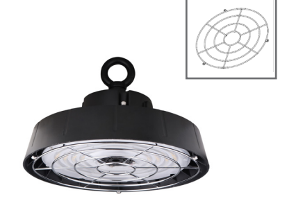
Wire Guard Order Code: 11567