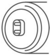
R17d Base Type