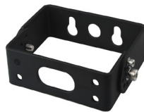
Yoke Mount Order Code: 11338

Easily access our DLC qualified products with rebates in your area.