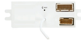
Order Code: 11804 Bluetooth® Mesh / Single Channel Fixture Controller Sensor Ready

EarthConnect, Bluetooth® networked lighting control system makes it easy to maximize energy savings, achieve code compliance for indoor applications. It's simple and intuitive. Using the EarthConnect app, nodes can be commissioned without the need for a gateway or Internet access.