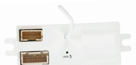
Bluetooth® Mesh Controller 12VDC Order Code: 11804

EarthConnect, Bluetooth® networked lighting control system makes it easy to maximize energy savings, achieve code compliance for indoor applications. It's simple and intuitive. Using the EarthConnect app, nodes can be commissioned without the need for a gateway or Internet access.