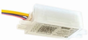
Low Bay Sensor Order Code: 11803