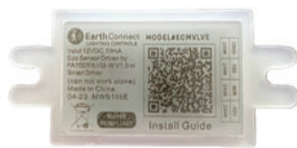
EarthConnect Microwave Sensor Order Code: 11803