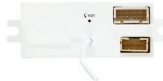
Bluetooth ® Mesh Controller 12VDC Order Code: 11804

EarthConnect, Bluetooth ® networked lighting control system makes it easy to maximize energy savings, achieve code compliance for indoor applications. It's simple and intuitive. Using the EarthConnect app, nodes can be commissioned without the need for a gateway or Internet access. For more information visit: https://www.earthtronics.com/product/earthconnect.com