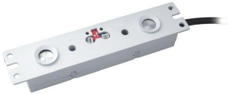
Microwave Sensor Order Code: 11898