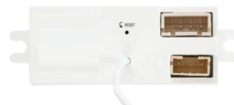
Bluetooth® Mesh Controller 12VDC Order Code: 11804