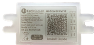
EarthConnect Microwave Sensor Order Code: 11803