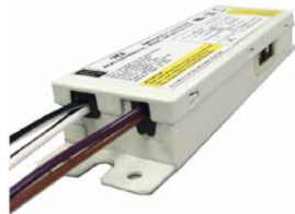
Emergency Backup Driver Order Code: 11639