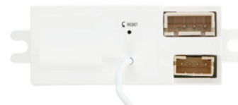
Bluetooth® Mesh Controller 12VDC Order Code: 11804

EarthConnect, Bluetooth® networked lighting control system makes it easy to maximize energy savings, achieve code compliance for indoor applications. It's simple and intuitive. Using the EarthConnect app, nodes can be commissioned without the need for a gateway or Internet access. For more information visit: https://www.earthtronics.com/product/earthconnect.com