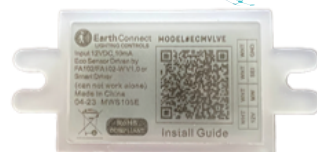
EarthConnect Microwave Sensor Order Code: 11803