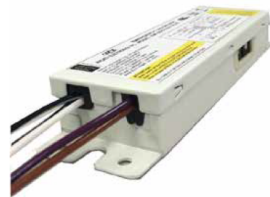
Emergency Backup Driver Order Code: 11639