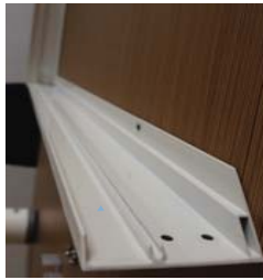
Channels where LED Panel fits